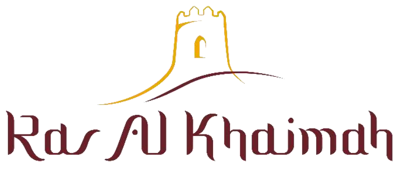
Tourism Development Authority