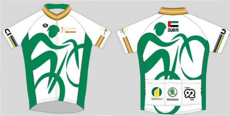
10 Year Anniversary Cycle Challenge Jersey

Cycle Challenge Jerseys: If you've pre ordered a 10 Year Anniversary Cycle Challenge Jersey you can collect it during Race Pack collection