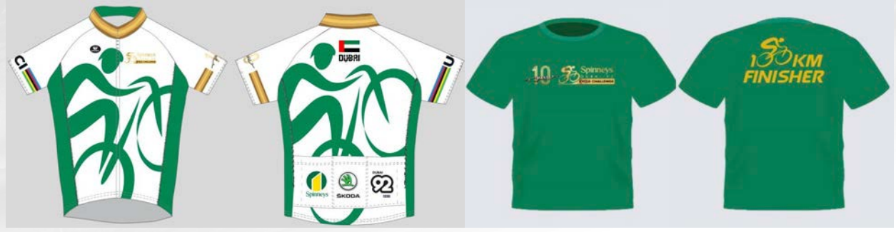
10 Year Anniversary Cycle Challenge Jersey

<u>Refer a Buddy and win a T-Shirt:</u> If you refer a buddy to register for the Cycle Challenge on Hopasports and you both complete the 100km Challenge, you will win a '100km Finisher T-Shirt' which you can collect from the Registration Tent after your race!