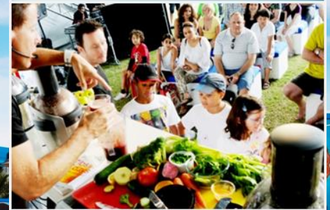
Healthy Food Zone

Static bicycles Yoga & pilates Badminton Table tennis Massage area