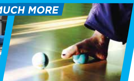
YOGA TUNE UP®